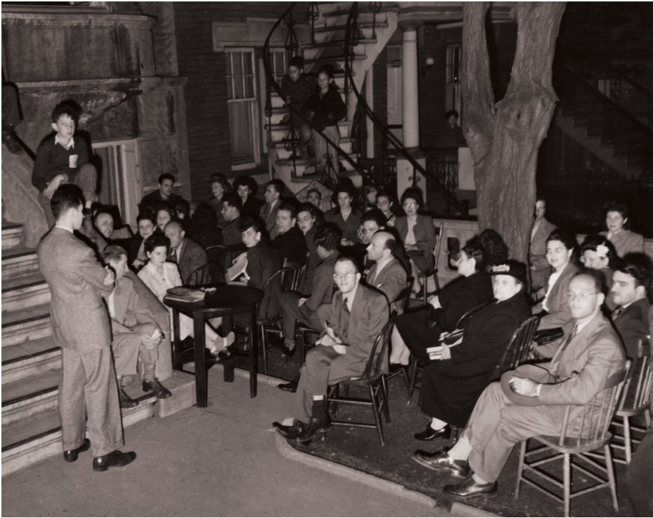
Exterior, unidentified event, Jewish Public Library, 4099 av de l'Esplanade, ca. 1940s. Jewish Public Library Archives, Photograph Collection, pr001068.

What do you notice about the people? It seems an apparently mundane scene, but if you look carefully more and more elements begin to pop out. Like the children looking on from the adjacent staircase, a neighbour watching two houses over. The JPL was right in the heart of the densely populated immigrant neighbourhood, with minimal separation between the courtyards and houses. It demonstrates the proximity of neighbours in the working-class downtown quarter of this time period. It also shows the somewhat messiness of the gathering: imagine taking out all of those wooden chairs into the courtyard. Could the crowd prevent the sounds of the children next door from interfering with the event? It is not clear where the focal point of the audience is, or what the table next to the stairs is being used for. How does this motley arrangement compare to the professional programs held in the modern JPL? Thirdspace makes evident the everyday movement of bodies through particular physical and symbolic locations. From this photograph alone it is impossible to know what program is being held, but we can observe the spatial arrangement, how people organized themselves within this setting, extending the boundaries of the physical JPL into courtyard and down the street.