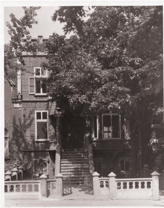
Exterior of Jewish Public Library, 4099 Esplanade, ca. 1950s.

Evidence of physical, symbolic and Thirdspaces of the JPL becomes more apparent when we examine the following set of photographs in relation. The new location of the JPL from 1930 to 1951 is a linked house with a majestic exterior staircase, balcony, beautiful tree and small, gated courtyard out front. These details signify the library’s relocation