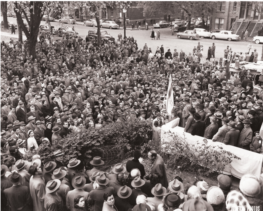
Full shot of street crowd and laying of cornerstone, Dedication Ceremony for New Library Building at 4499 Esplanade, Jewish Public Library, October 4, 1953. Jewish Public Library Archives, Photograph Collection, pr000179.

Another photograph enhances the punctum , the jolt a single viewer might experience looking at photograph and seeing something that the photographer never intended. What do you see in this picture?