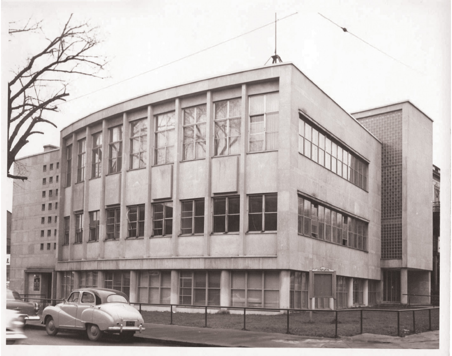
Exterior of the Jewish Public library, 4099 Esplanade, ca. 1950s.

before the foundation is laid. And as Baker argues, this moment captures the civic engagement of the Jewish community and a claiming of a space for their community. Compare the messiness of bodies rubbing shoulders in the city streets with the stoic and stately modern building that would soon occupy this “empty” space.