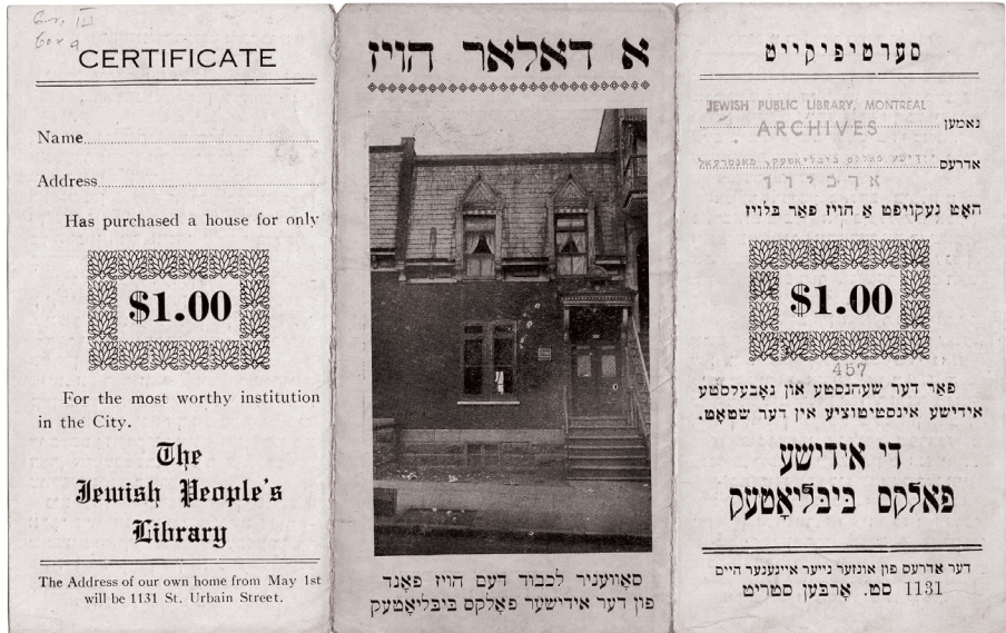
Certificate of the purchase of 1131 St-Urbain to house the Jewish Public Library, ca. 1920s. Jewish Public Library Fonds (Historic), File 00186.

Spatial analysis enables us to interpret Jewish life in Montreal beyond what history or sociology can do in isolation. Examine the following artifact: