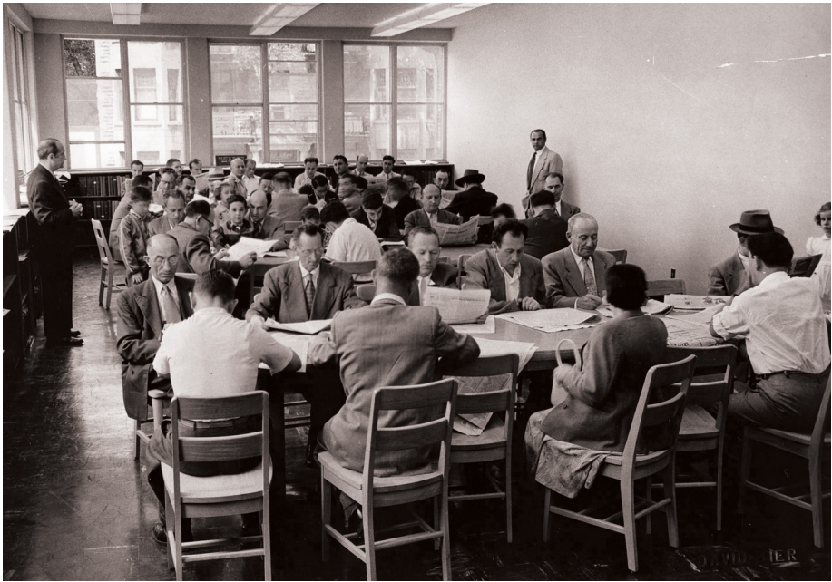
Interior, reading room filled with patrons, 4099 Esplanade, ca. 1953. Jewish Public Library Archives, Photograph Collection, pr001787.

On first glance, this is very obviously a reading room, filled mostly with men in suits reading newspapers. The windows along the wall allow natural light to fill the room and the long tables maximize the working space for the adult readers. But look carefully. Suddenly children start to pop out: a girl to the far right in a white dress. Three boys gather around two men in the middle table, presumably their fathers teaching them or reading to them. Another little girl appears, standing behind the boys possibly disengaged or almost ignored, like the other girl in the picture.