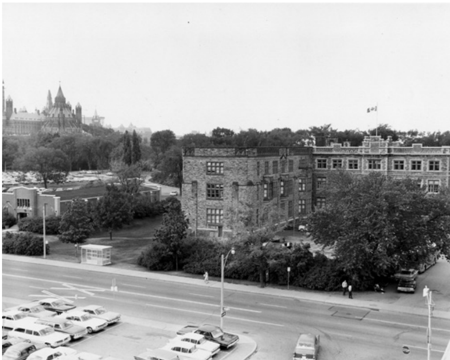
The original Canadian War Museum on Sussex Drive.

As for the Canadian War Museum, its mandate is threefold. First of all, the museum honours Canadians who served in war or who subsequently lost their lives in battle. Second, the museum provides space to examine Canada's involvement in battle and to consider the impact of war upon the country and its citizens. Finally, the Canadian War Museum documents the country's military contribution to peace-keeping and security both at home and abroad. In short, the mandate of the Canadian War Museum is to remember, to preserve, and to educate. 15