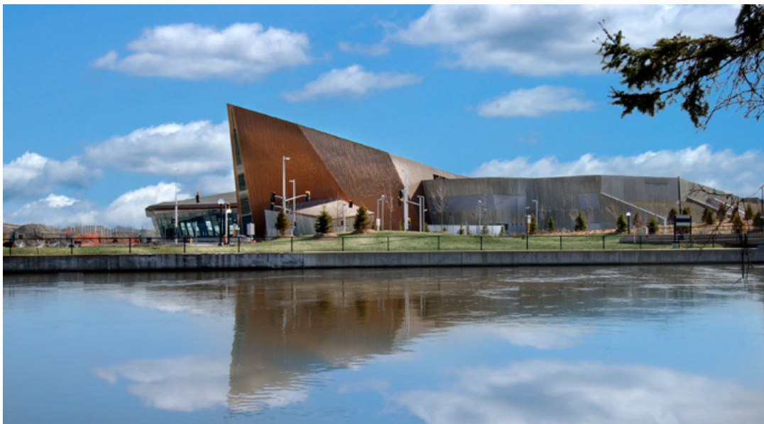
The new Canadian War Museum located on the LeBreton Flats opened in May 2005.

The deliberations of the Senate Subcommittee hearings held to debate the proposed Holocaust gallery clearly demonstrate the influential lobbying power of Canada’s war veterans. This was put on full display, nearly ten years later, when the Canadian War Museum revised its Bomber Command exhibition after being pressured by various veterans’ groups. A panel titled “Strategic Bombing: An Enduring Controversy” questioned the effectiveness of the Bomber Command raids over Germany, highlighting, among other issues, the number of dead and those left homeless. Facing pressure from veteran groups the museum revised the panel despite the fact that four professional historians – upon further review – all agreed that the exhibit was historically accurate. 52 Like the proposed Holocaust gallery, veteran groups were uncomfortable with the framing of certain subject matter by museum staff. Consequently, they rallied the support of veterans across the country, provoked media coverage and garnered national, public support. In so doing, they altered the content of the museum space.