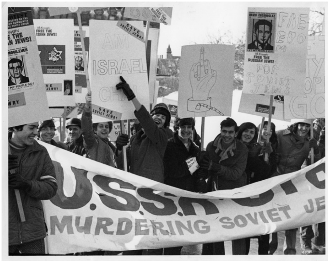
Save Soviet Jewry demonstration, YM-YWHA, Montreal, c. 196-? Fonds 1255, PR010119.

The Six-Day-War brought to the fore a heightened awareness among Montreal Jews of the plight of world Jewry and specifically that of Soviet Jews. Soviet Jews who proclaimed their Jewishness and support for Israel suffered greatly under that regime, and Canada's new identification with Israel extended to people oppressed in its name. The newly formed Committee of Concern for Soviet Jews reached out to Jews around the world for support, and Jewish student groups responded rapidly.