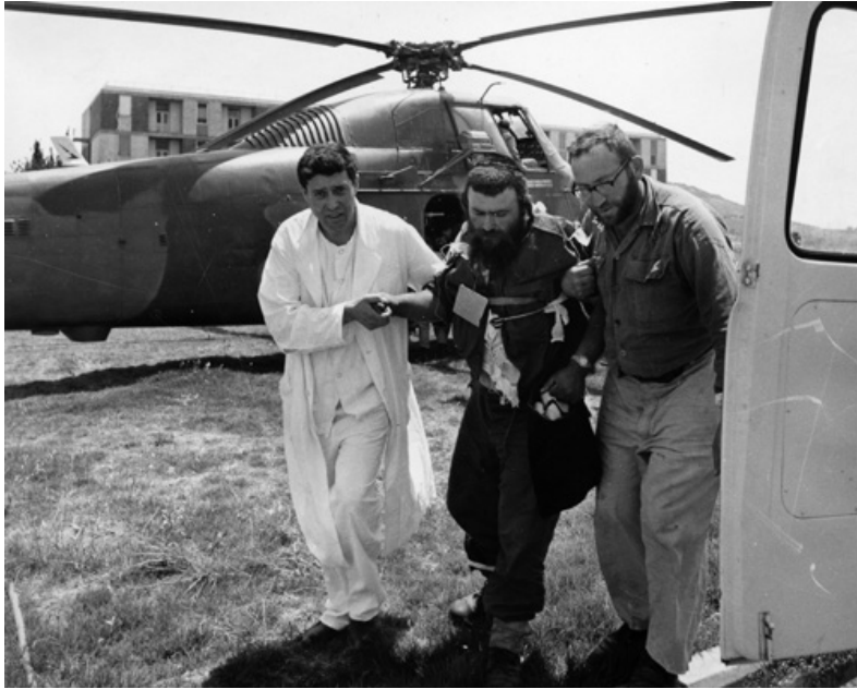
Unidentified men assisting soldier from helicopter to ambulance during the 1967 Arab-Israel War, Israel. Fonds 1255, PR009871.