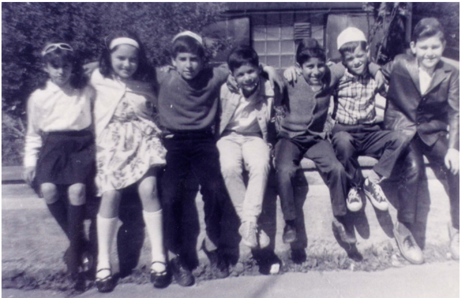
A Saint John Hebrew school class, circa 1970.

The archives of the Saint John Jewish community also document educational programs held under the auspices of Young Judea, including debates and newsletters; Hadassah, including programs and educational booklets; Ezra Lodge Habonim and B'nai B'rith, both of which regularly included educational components into their