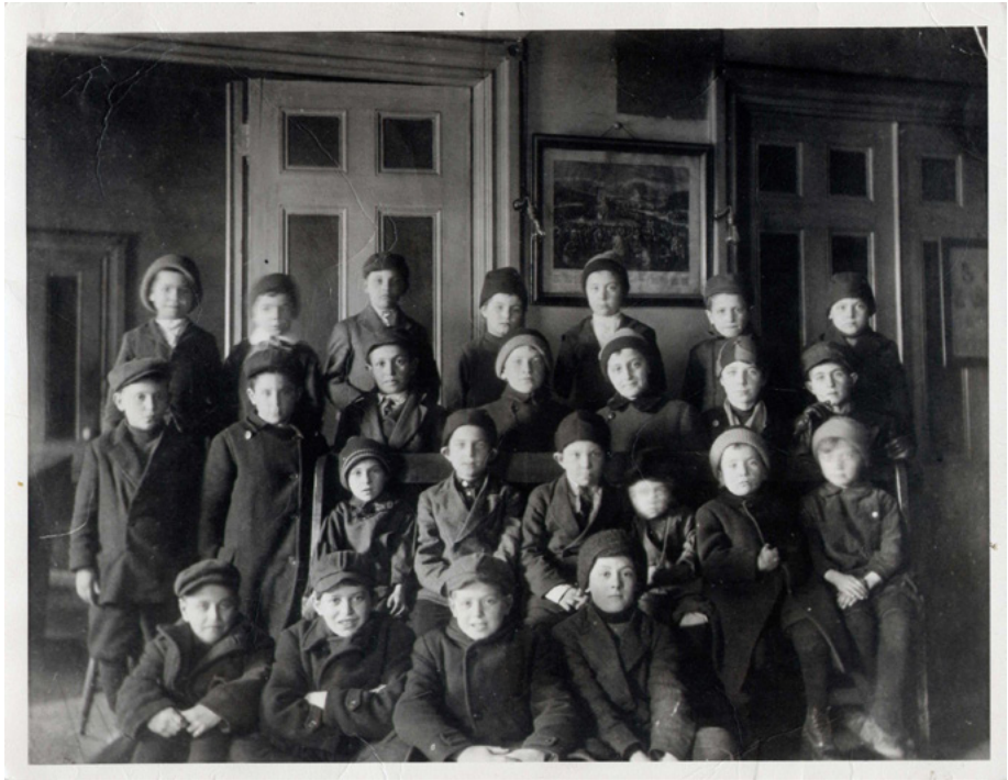
The Saint John New Brunswick Hebrew School, circa 1914 or 1917.