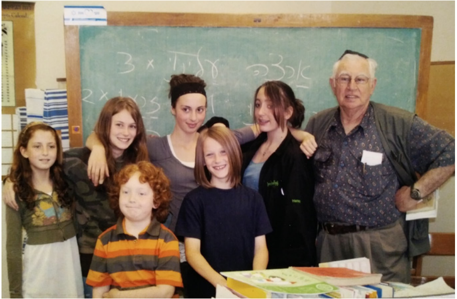
A Saint John Hebrew school class, circa 2010.

Source: Collections of the Saint John Jewish Historical Museum